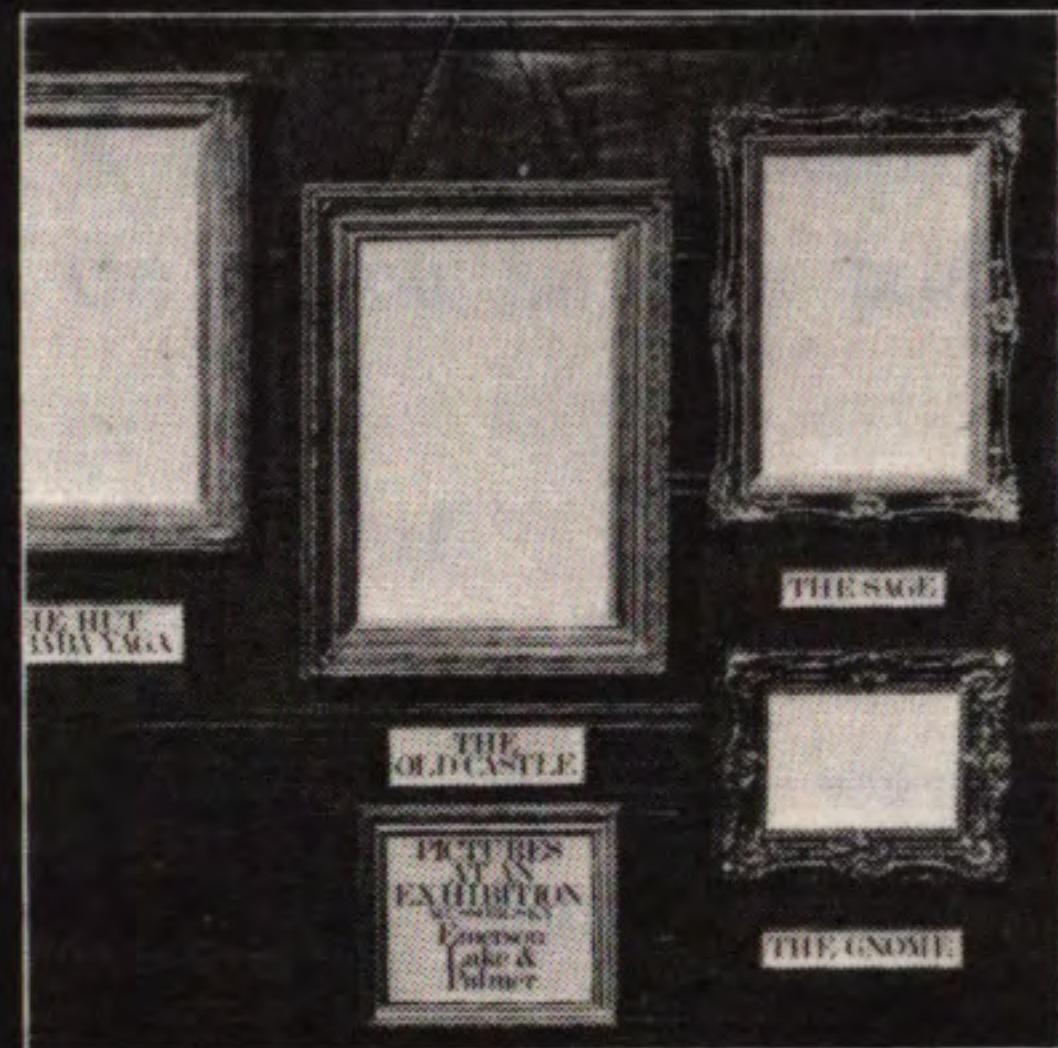
展覧会の絵 フロムナード/賢人/キエフの大門/ナットロッカー 他全11曲 P-8200A