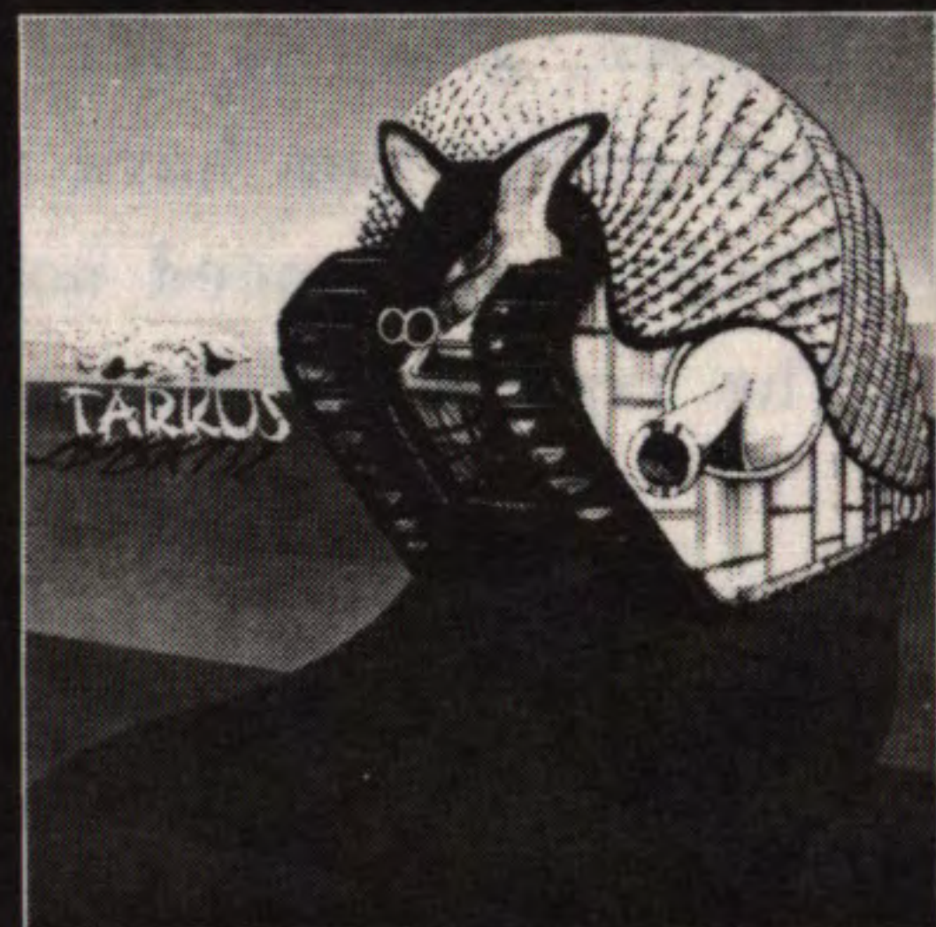
タルカス エラプション/予言者/アクアタルカス/ジェレミー・ベンドナー 他全13曲 P-8133A