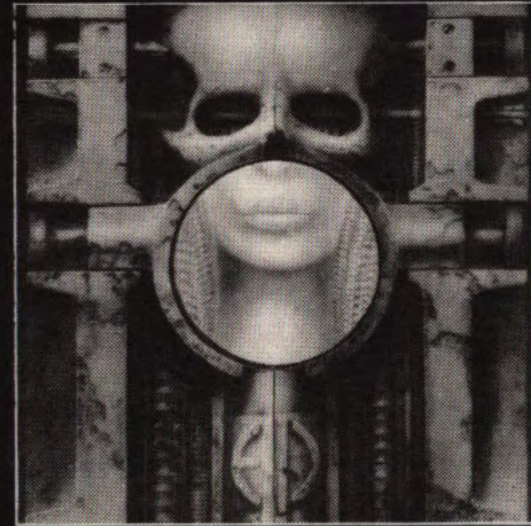
恐怖の頭脳改革 聖地エルサレム/トッカータ/スタイル〜ユー・ターン・ミー・オン/悪の教典#9 他全8曲 P-8395M